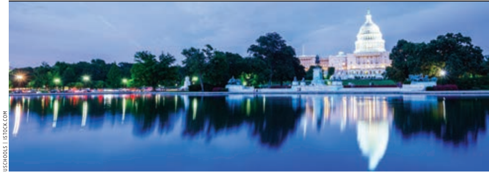
US SCHOOLS | ISTOCK.COM