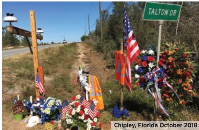
Chipley, Florida October 2018

We appreciate the countless acts of kindness our linemen and other employees receive when they are working in severe weather or its aftermath. Our employees are thankful for your patience, care and concern while they work to restore power during prolonged outages amid challenging conditions. Those cups of coffee and bowls of stew are appreciated. Our office