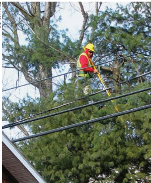
Keeping rights-of-way clear reduces outages and provides a safer environment for co-op members and employees.

If severe spring weather blows through, a well-maintained ROW leads to