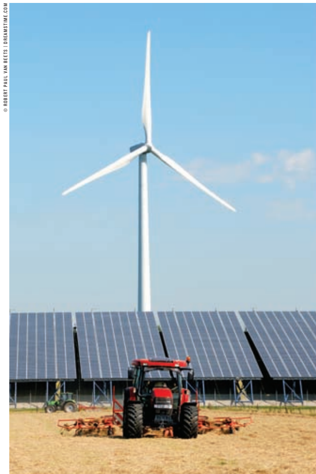
Alternative energy sources such as wind and solar are likely to help fill energy needs in the future, but conserving today is one of the best things you can do to help solve our energy problems.

As always, your cooperative stands ready to help you with advice and ideas on how to make the wisest use of electricity.