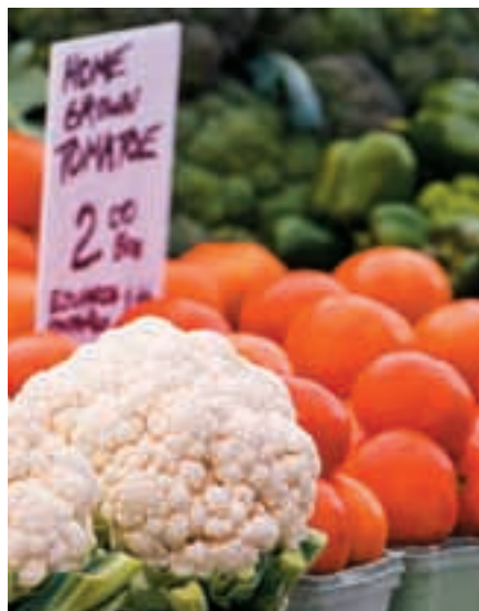
There’s nothing better than homegrown vegetables and being a member of your ‘homegrown’ local electric cooperative.

Lamar EC will be closed Friday, July 4, for the holiday.