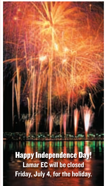
Happy Independence Day! Lamar EC will be closed Friday, July 4, for the holiday.