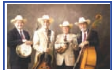
THE BLUEGRASS SOLUTION