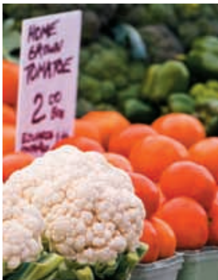
There’s nothing better than homegrown vegetables and being a member of your ‘homegrown’ local electric cooperative.

Members in attendance were treated to lunch catered by Scholl Brothers Barbeque.